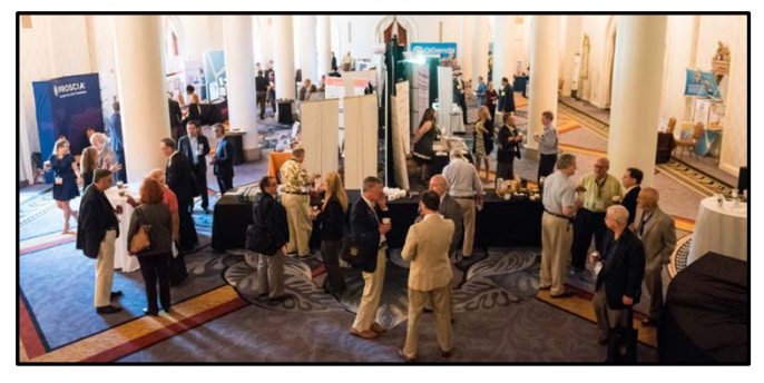
Past Exhibitors include: AAPA, APF, ARP Press, ASCP, ASIP, CAP, Corista, Change Healthcare (McKesson), Elsevier, Genentech, GRM Document Management, Inspirata, ICPI, Kellison & Co., Medusind Solutions, Mopec, Motic, Olympus, Pathcore, Philips, Proscia, QGenda, Sakura, Vachette, ViewsIQ, and Visiopharm.